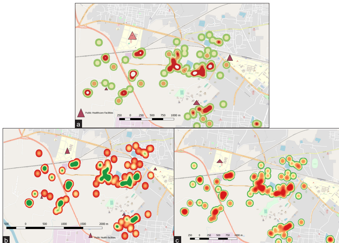
Figure 2: The heat maps showing spatial distribution of fever and cold cases among (a) children under five, (b) mothers as decisionmakers, and (c) private physician consultations. (a) Triangle: Public multispecialty hospital, Red area: Cluster houses with equal or more than two fever and cold cases, Green area: Houses without fever cases or less than two fever cases or without cold cases. (b) Triangle: Public multispecialty hospital, Red area: Cluster houses with mothers as decision makers, Green area: Houses with family members other than mothers as decision makers. (c) Triangle : Public multispecialty hospital, Red area: Cluster houses that consulted private healthcare facility, Green area: Houses that consulted public healthcare facilities.

The study has inherent limitations because of its design as a cross-sectional survey. We could not assess in detail the reasons for seeking care in private facilities or reason for not accessing care in a multispecialty public hospital because of resource constraint. There is a need for further qualitative and mixed method studies to assess various facets of this issue. The selection of a vulnerable population like the urban slum